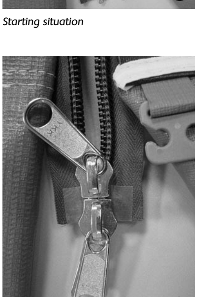
Move the second slider against the first slider