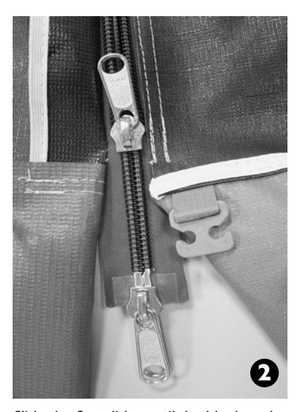
Slide the first slider until the block end over the insert parts