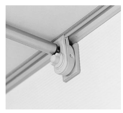
the Quick Lock pads

By tightening the large nut, the Quick Lock pad will be locked firmly onto the Quick Lock profile. Now it is easy to insert the roof rafter into the Quick Lock pad. By tensioning your roof rafter you will automa-