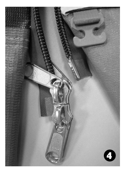
Both zip halves are now easy to separate